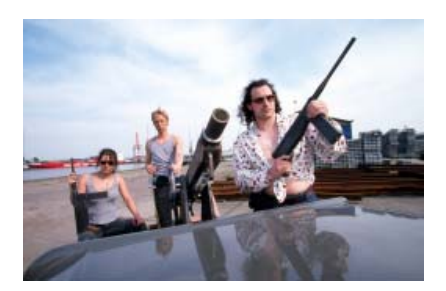
Figure 4. Joep van Lieshout and crew, Photo: ©Atelier van Lieshout