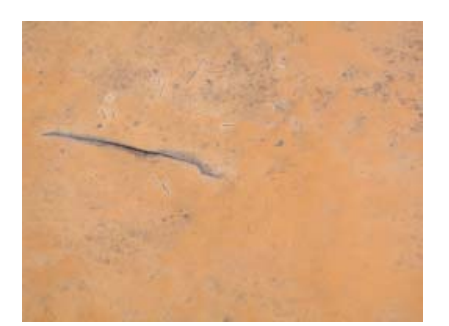
Figure 6. Detail of cracked GRP on the roof of the master unit

structures created with polyurethane foam including the sleeping unit (Figure 5). A moulding technique is used to create shiny surfaces. To form the skylights a technique has been developed to make use of gravity. A sheet of polyethylene is hung from a framework to form a curved shape from an inverted skylight. This is covered with glass fibre mats and polyester resin and, after curing, the supporting sheet is removed. Bubbles and folds in the transparent skylights reveal the handwork and the AVL touch. The book promotes the idea that the art-making process is not restricted to the artist or his studio.