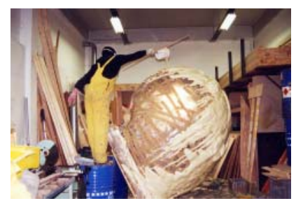
Figure 5. Making of the sleeping unit, pouring expanded polyurethane foam over an air pumped bulb of polyethylene sheeting shaped by self-adhesive tape, the basis for a hand lay-up polyester finish, Photo: ©Atelier van Lieshout